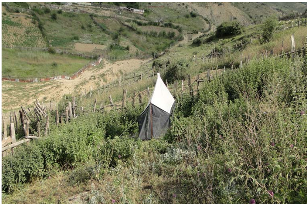
Figure 1 The habitat in which specimens were collected by Malaise trap (Gaznasara).

- Laterope deep (Fig. 3E); median carina of propodeum absent; length of ovipositor sheath 0.15 times as long as fore wing (Fig. 3A); vein 1-R1 of fore wing 1.4 times as long as pterostigma (Fig. 3C); eyes 1.1 times as long as temple in dorsal view; scutellum distinctly convex; antenna with 22 segments (Fig. 3B)..... S. xanthocephalus