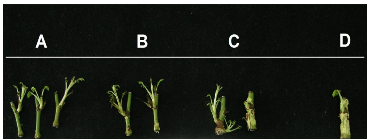
Figure 2 Effects of ribavirin treatment with different concentrations for a period of 40 days on the survival of rose explants grown in vitro : untreated control (A); treated with 10 mg/l (B); 20 mg/l (C); and 30 mg/l (D) of ribavirin.